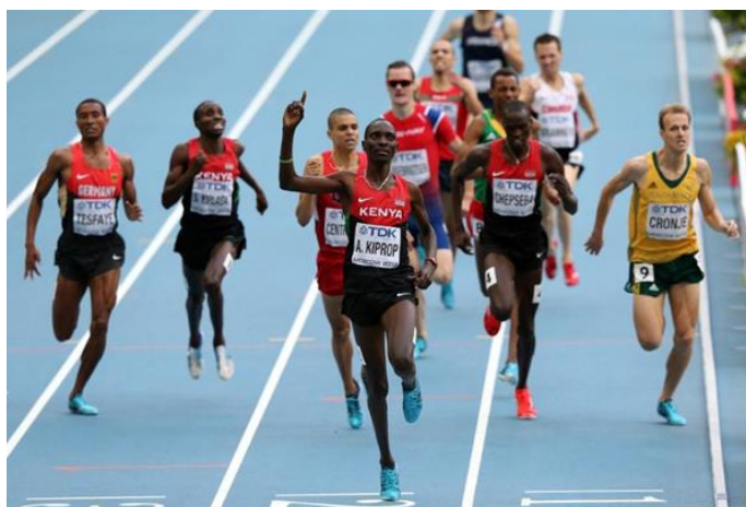
Johan Cronje has a clear run on the inside in the last few metres of the 1500 m. The SA record holder finished third behind Asbel Kiprop and Matthew Centrowitz (third from left).